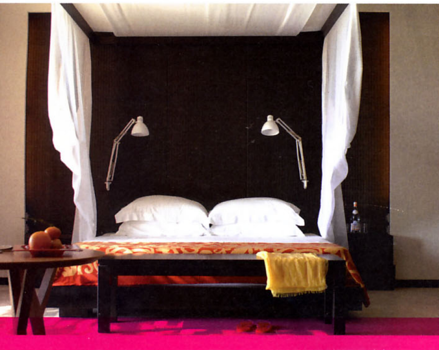
A junior suite at Verdura Golf & Spa Resort, designed by Olga Polizzi, on the southwestern coast of Sicily.

This 62-room Napa Valley newcomer is upping the ante on green design: built almost exclusively from salvaged stone and reclaimed wood, it's the world's second LEED-certified Platinum hotel. But the modern, California-clean aesthetic (concrete floors; custom-designed couches) delivers a breath of fresh air amid Yountville's faux French and Tuscan styles. Almost everything at the hotel, from the Coyuchi cotton bed linens to the seasonal menu at the »